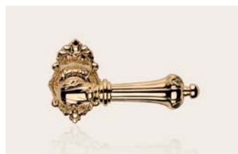
oro zecchino gold plated OZ