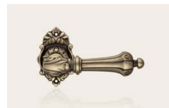
patiné patiné mat PM