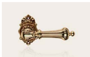
oro francese french gold OF