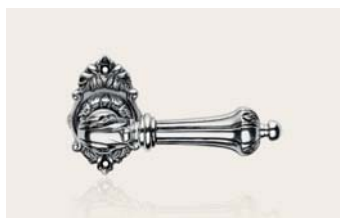
nero francese french black NF