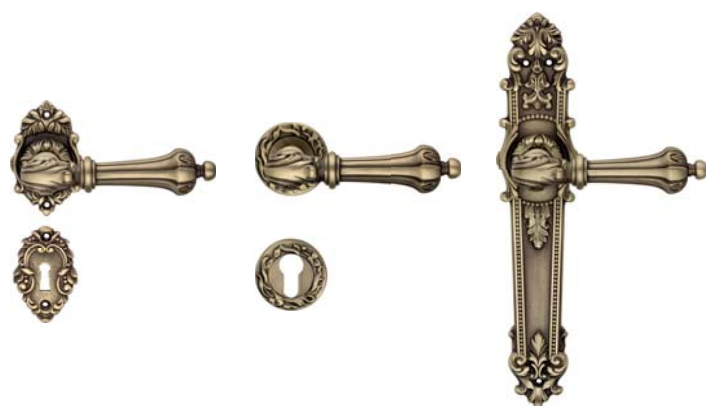
1590 RB 008